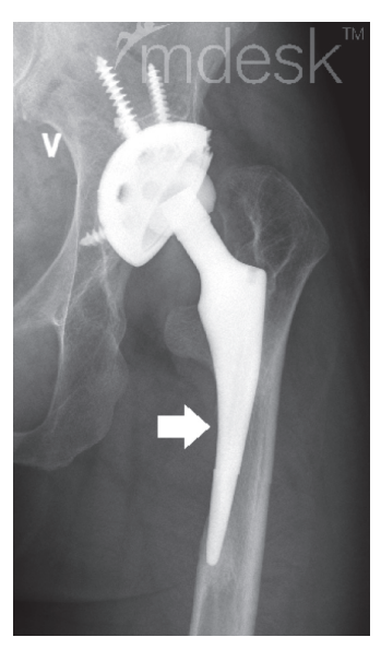
Figure 2. Example of cortical atrophy of fixed stem (white arrow).

70 patients (81 hips) came to the clinic, and Harris hip score (HHS) was obtained.